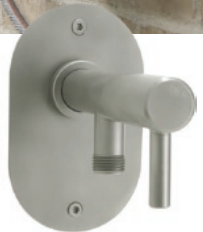
WALL WATER TAP