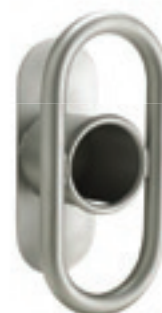
Wall and Ellipse Hose Bracket